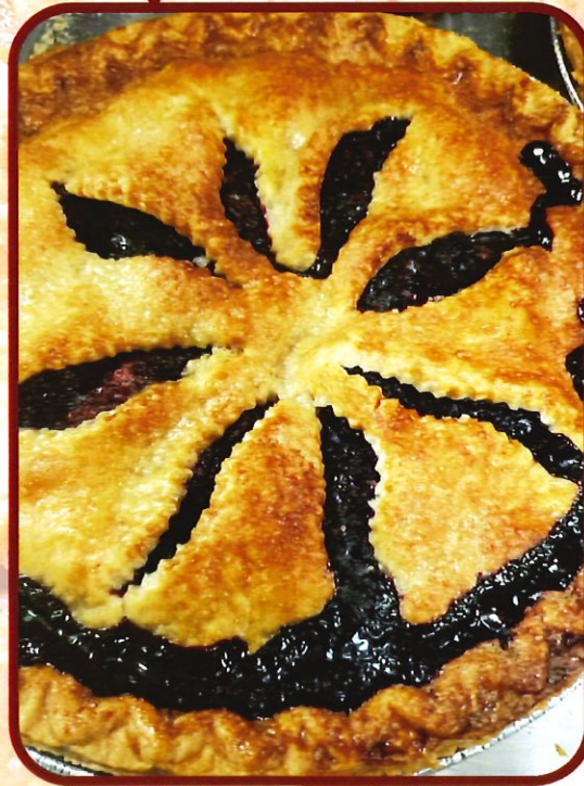
9" DOUBLE-CRUST FRUIT PIES AVAILABLE IN HALF- AND WHOLE PIES

CHOOSE FROM APPLE, CHERRY, PEACH OR BLACKBERRY