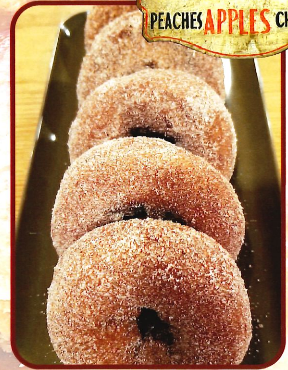
CINNAMON-SUGAR CAKE DONUTS BY THE HALF-DOZEN

MOIST AND DELICIOUS PERFECT FOR SNACKS, BREAKFAST OR GIFTS