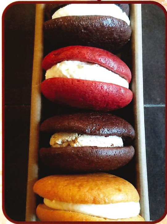
WHOOPIE PIES PACK OF FOUR

CHOOSE FROM TRADITIONAL CHOCOLATE WITH WHITE FILLING OR VARIETY PACK (INCLUDES 4 DIFFERENT SEASONAL FAVORITES)